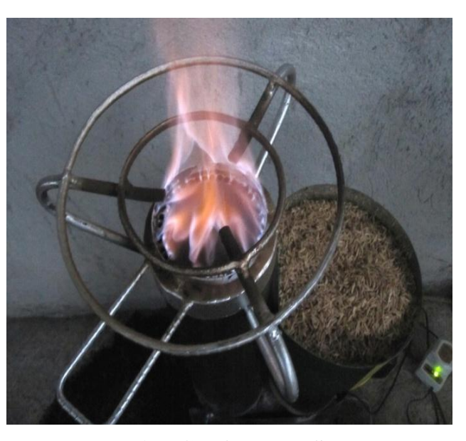
Burning Gas from the Stove

PARTS OF CONTINUOUS-FLOW RICE HUSK GAS STOVE