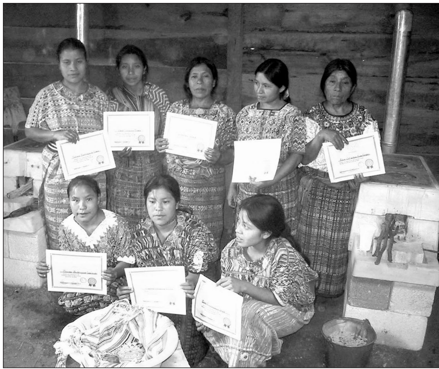
Figure 4 Trained stove promoters with their certificates

Once the project concept is well defined, prototypes are constructed and are typically tested in a laboratory environment. The goals of the labora-