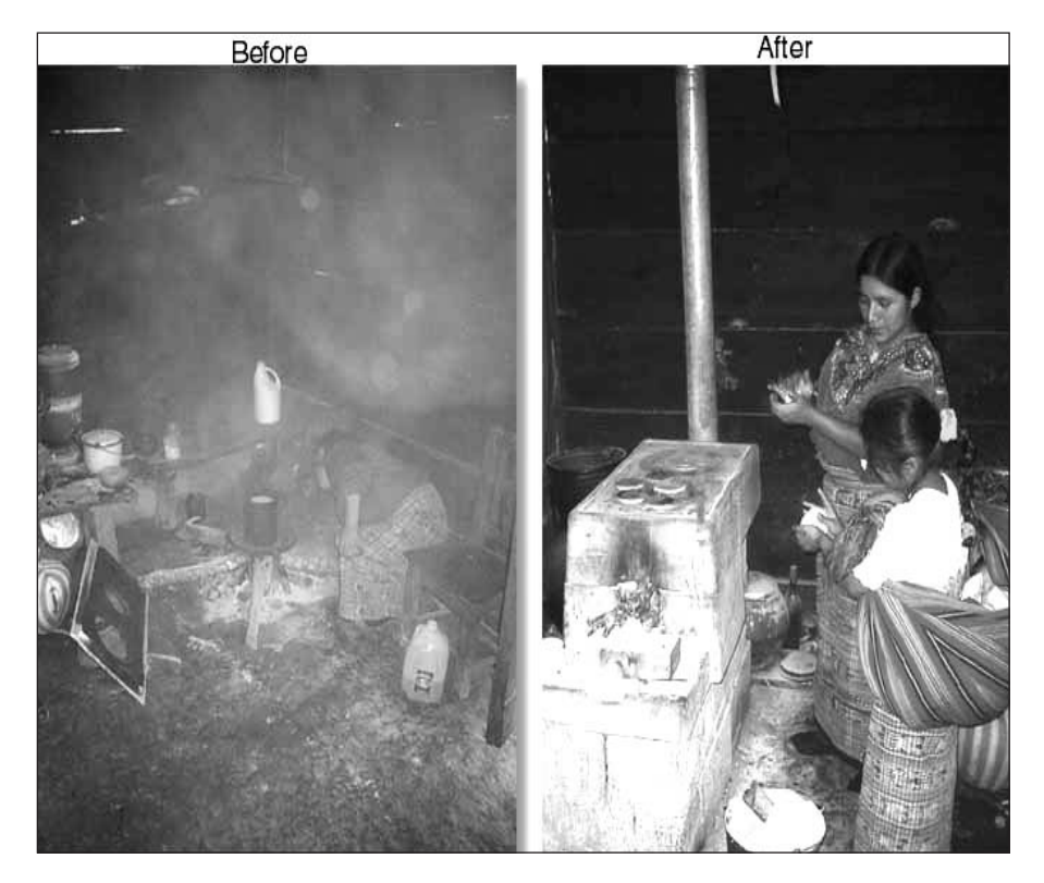
Figure 2 Impact of stove installation on kitchen

stoves are sold to other NGOs for use in their community development projects. Some of these NGOs elect to part-subsidize their installations; others use micro-credit, while others sell at full price up front. All NGOs and end users receive in-depth training and follow-up inspection.