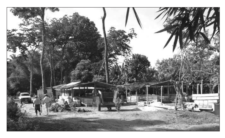
Figure 3 HELPS Rio Brovo stove factory