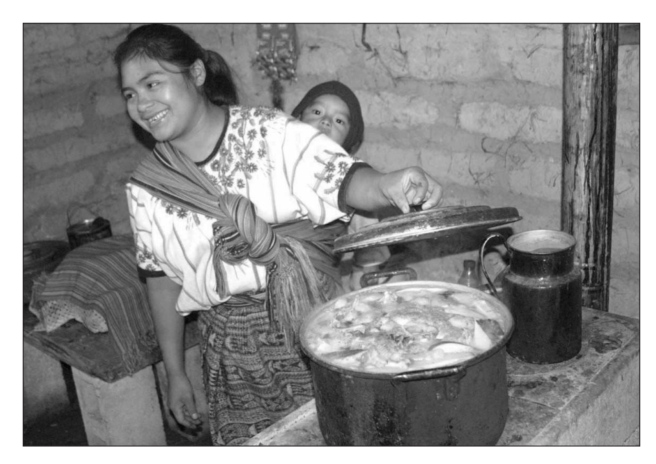
Figure 1 Woman cooking on a HELPS stove

If our goal is only to have a commercial operation supplying the somewhat affluent, that can be done today. If we are to solve the problems confronting the poor, then our programmes must include poverty reduction components that will 'lead' to commercialization with time. If we rush to commercialization without first reducing poverty, the poor will still be without solutions. Poverty reduction programmes are needed which address health, education, and economic development. Such programmes will increase the purchasing power of those now poor to a level that they can, in the future, pay for a commercial stove as well as paying for better housing, food, health